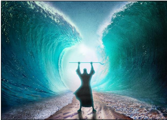
Moses's faith parted the Red Sea

Prayer is the foundation of our relationship with God. Through our prayers, in a true partnership of love, God can change this world for the better. It is our choice whether to be with God our Creator, who makes everything possible, and to ask him for assistance or to think we can do everything on our own and to suffer the consequences. Our Lord Jesus Christ keeps telling us that prayers are his only hope for this lost, chaotic world in turmoil.